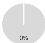
2. Taxonomy-alignment of investments excluding sovereign bonds*